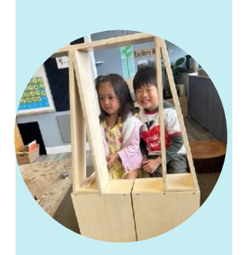
Busy Lil' Saints!

Our busy JK class has been enjoying extended outdoor time, with garden play being the highlight of their day! Sand and water activities continue to captivate the children's attention, inspiring many imaginative and cooperative games. Additionally, most of the children can now print their own names and recognize their classmates' names. The free art table and building area remains to be the most popular spots in the classroom, as the children are eager to create and practice the various skills they have learned.